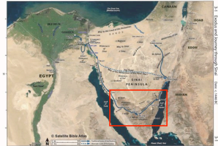
3-1 Exodus and Journey through Sinai Date: c. 1466 BC

https://www.gotquestions.org/mount-Horeb.html