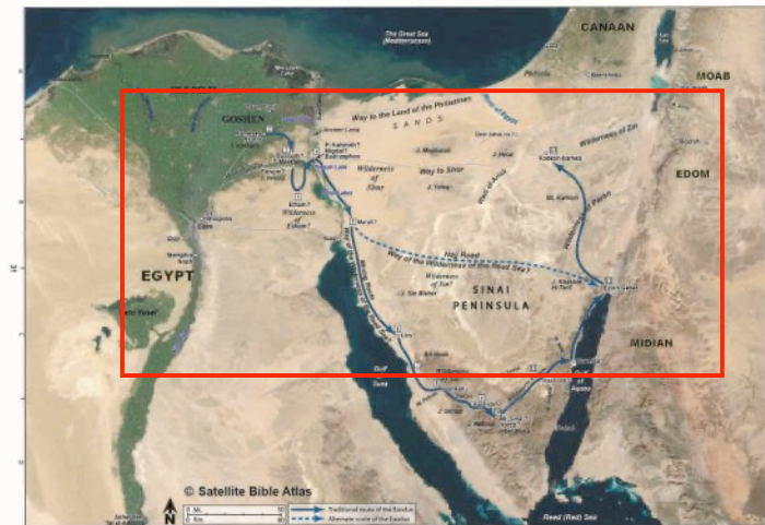
3-1 Exodus and Journey through Sinai Date: c. 1446 BC