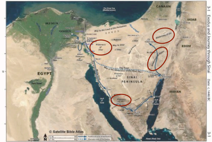
3-1 Exodus and Journey through Sinai Date: c. 1446 BC